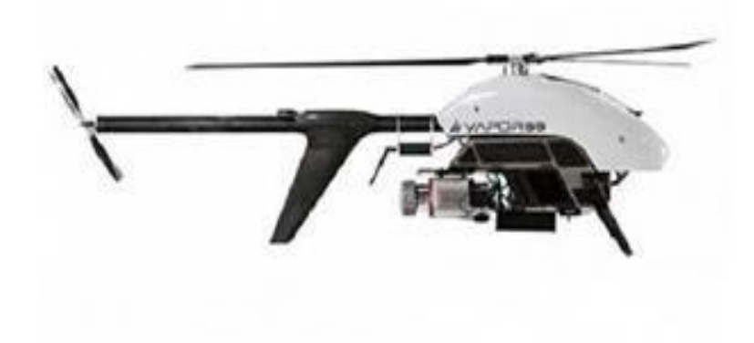
FIGURE 3. Unmanned aerial vehicle.